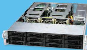
Cloud Data Center CloudDC DP 2U (P.12)