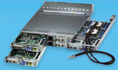
Cloud Services BigTwin® 4-Node (P. 10)