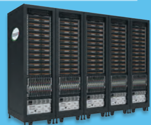
World Class Total IT Solutions (P. 16)