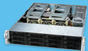
Cloud Data Center CloudDC UP 2U (P. 13)