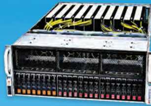
Media and 3D Environments Omniverse (P. 4-5)