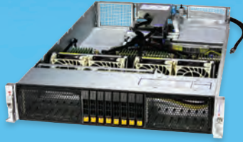
High Performance Enterprise Hyper (P. 8-9)