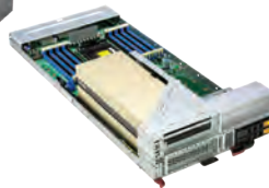
SBI-611E Blade with 2 GPUs