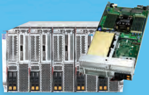
AI, Data Analytics, HPC SuperBlade® 6U (P. 7)