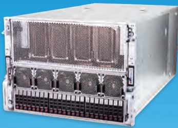
AI, ML and HPC Delta-Next (P. 3)