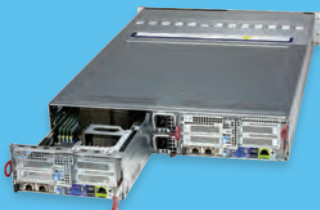
Content Delivery Network BigTwin® 2-Node (P. 11)