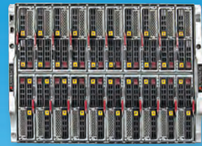
Cloud, HPC, Enterprise SuperBlade® 8U (P. 6)