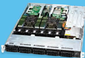
Social Media Hosting CloudDC DP 1U (P. 14)